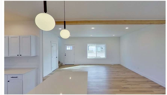
(Actual interior may vary from photographs)